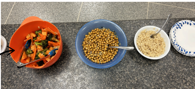
Cooking from the Calendar November recipe: Hearty Harvest Bowls 10/10!