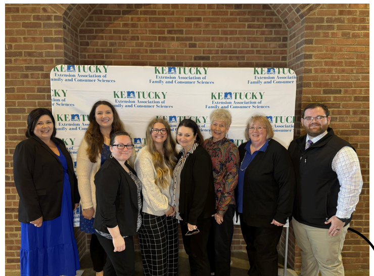
KEAFCS Annual Meeting with fellow area FCS Agents!